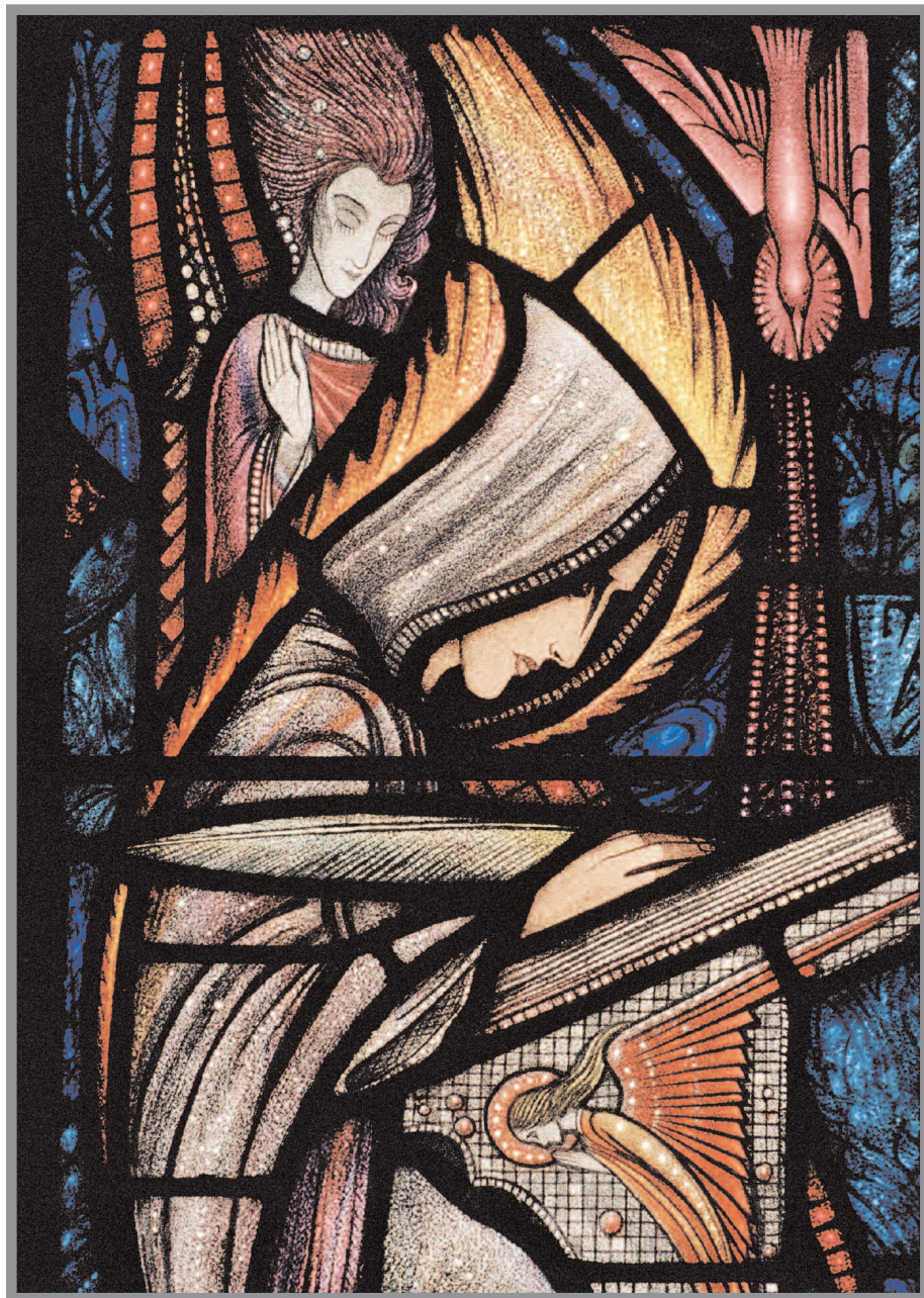
Stained glass of an Irish scribe in Baptist Library

ing today in the areas of human rights, the origins of the universe, and democratic political life. Interspersed throughout these essays are shorter reflections from a number of thinkers, including faculty members at Boston College.