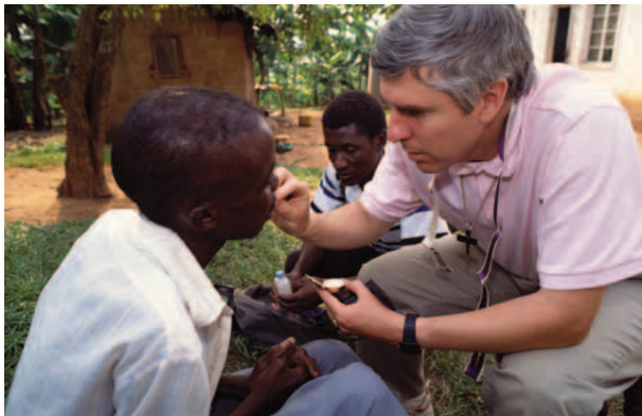
"AIDS Patient Receiving Communion"

Catholics remain faithful to the truth of Jesus' real presence in the elements. The Eucharist is truly the body of Christ. "My flesh," Jesus tells us, "is food indeed and my blood is real drink. He who eats my flesh and drinks my blood lives in me and I live in him" (Jn 6:55-57). This understanding of Christ's real presence in the Eucharist is broader than his real presence in the elements. Christ is also present in the Scriptures we proclaim as we break open the word. As the fathers of the Church always insisted, it is Christ who speaks to us through the Scripture and who preaches. He is also present in the assembly, which becomes, no less, his body. The symbol of the body of Christ is a metaphor for the real transformation of elements, human words, and community. It also is a potent symbol of a social justice of inclusiveness. The body, though composed of many parts, is,