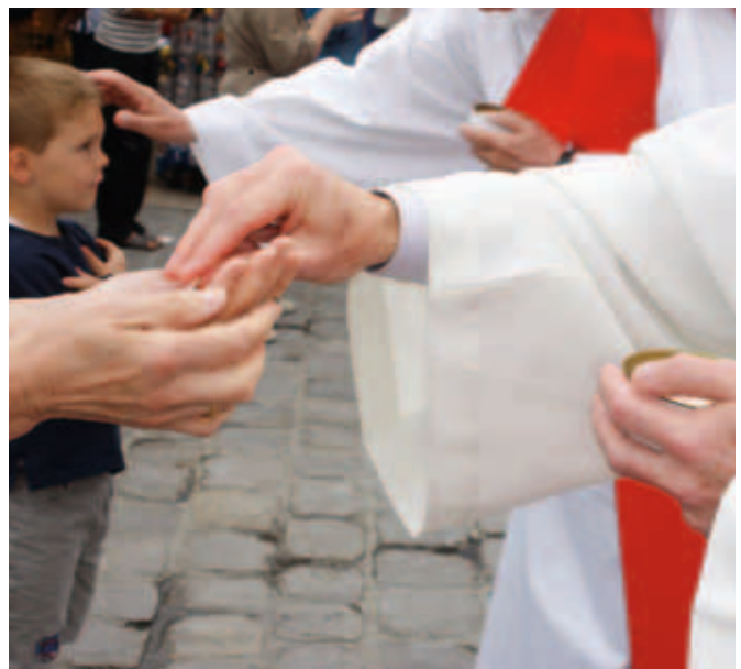
“Holy Communion”

This means encouraging them to figure out how they should live now that they’ve celebrated and received Eucharist. Here, raising good questions may be more effective than giving directives. So, consider asking, where and how is Jesus inviting you? How are you to reach out with love and care for others, to share your Eucharist with the world? What might you try to do or change in your life? While Jesus is your best