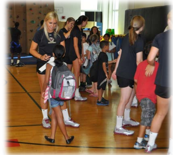
Oak Square YMCA

Help Educate Through Athletic Responsibility (HEAR) Program