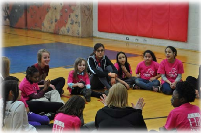
West End House