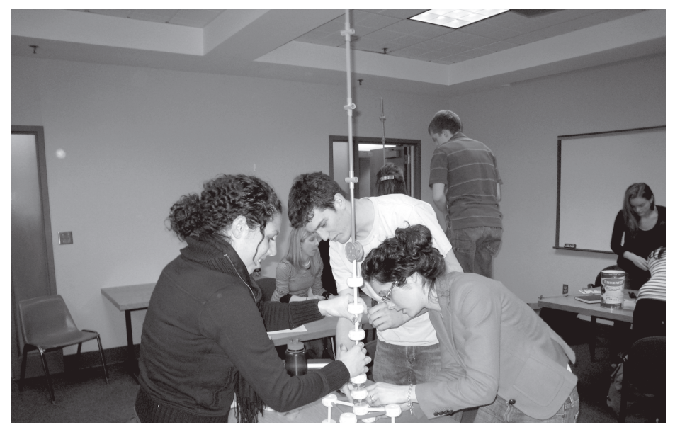
Jenks students at work during the "Failing Forward" workshop.