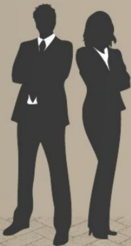
Average Salary by Job Function

Choosing to pursue your MBA at Boston College's Carroll School of Management is the first step. As a top-tier globally recognized institution and an icon in its own right, BC will give you more than an MBA, you'll get an edge—a location in one of the top financial centers in the world, a strong and fiercely loyal alumni network, and a name employers respect. Yes, you'll work hard, and you'll do so knowing that by graduation you'll have all the tools and confidence you need to make your mark.