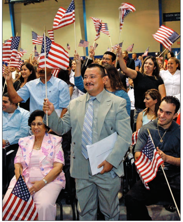
Mexican Americans celebrate their swearing-in as U.S. citizens in Phoenix, July 4, 2007.

associated with any such population movement, and often blinded by selfinterest, these elites have refused to view this influx as anything other than a blessing to America's culture and a boon to the economy.