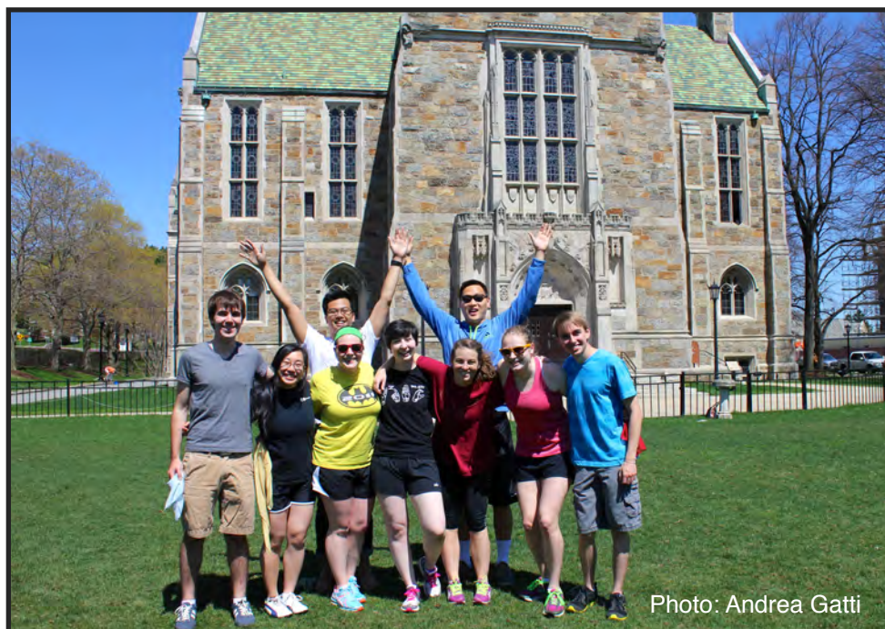
Scholars enjoy a "field day" playing soccer on Bapst Lawn