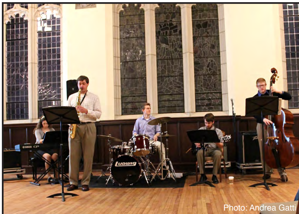
BC Bop plays a few jazz numbers in Gasson 100.