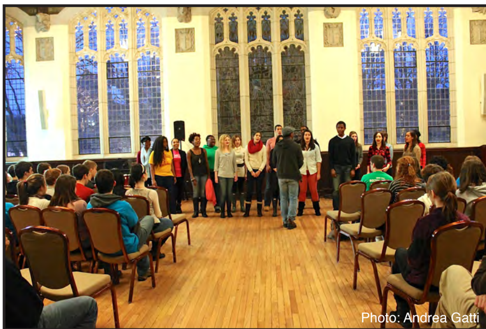
Voices of Imani perform at the benefit concert.

As part of the program's focus on social justice, the sophomore Scholars are responsible for coming together as a class and organizing a series of events aimed at raising awareness about a social justice issue of their choice. Drawing from our experiences from last year's Summer Service Learning Program during which each of us volunteered at two placements in Boston for six weeks, the topic we chose to focus on was adult education. We felt that resources and attention are often directed at providing adequate education for children; however, adults who may have missed out on these opportunities are often forgotten. Many of us had personal encounters with this fact as we worked in prisons, homeless shelters, and ESL programs, all of which were working to provide adults with the support they needed