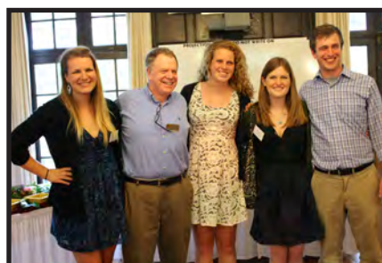
The Class of 2013 celebrates with family and friends at the PSP Senior Reception on May 19th at Barat House.