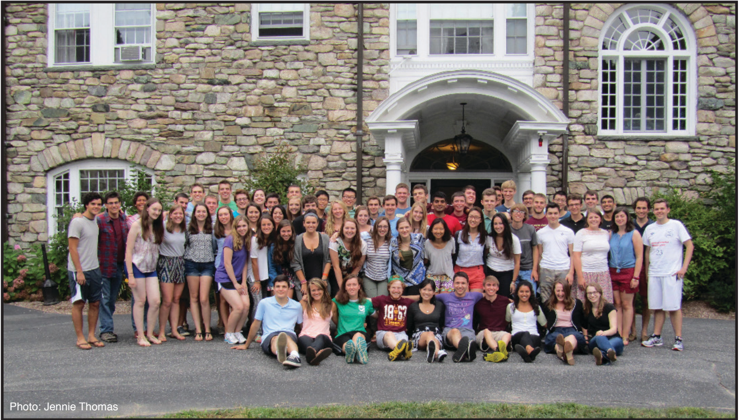
Scholars pose for a quick photo before returning to campus.