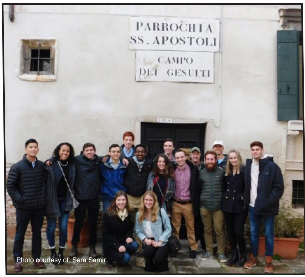
Con't on page 3