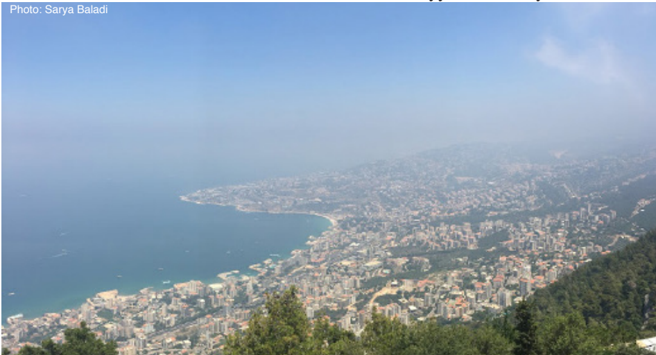
Views of the coast of Beirut, Lebanon