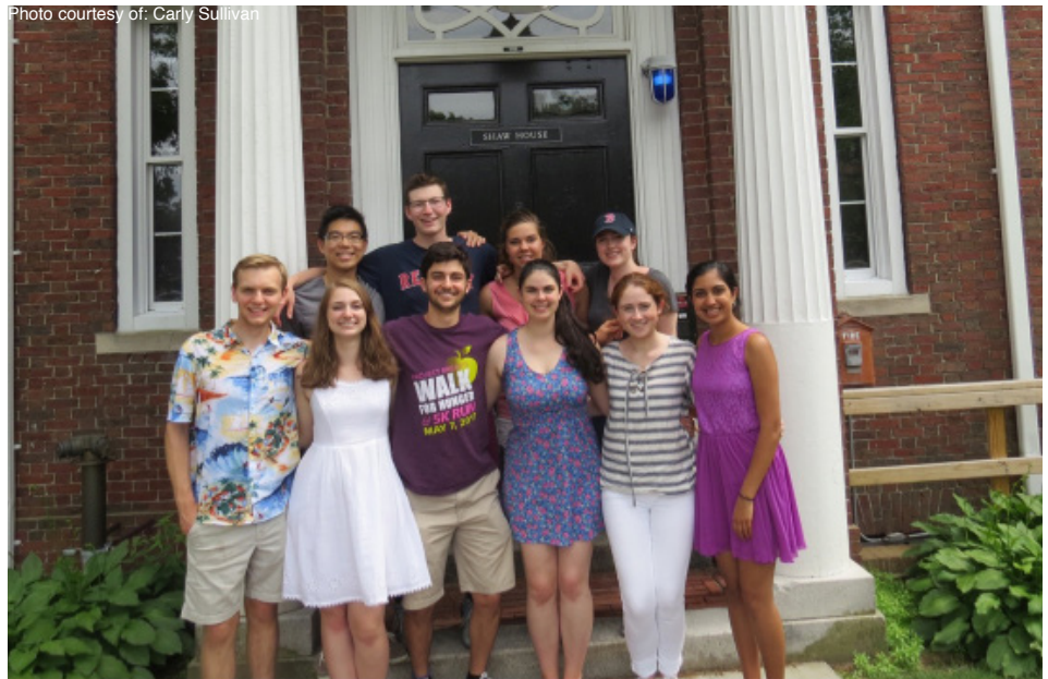
Members of the class of 2020 says goodbye after six weeks together

us to engage with the communities we served. The work we did and the individuals we met will continue to inform our