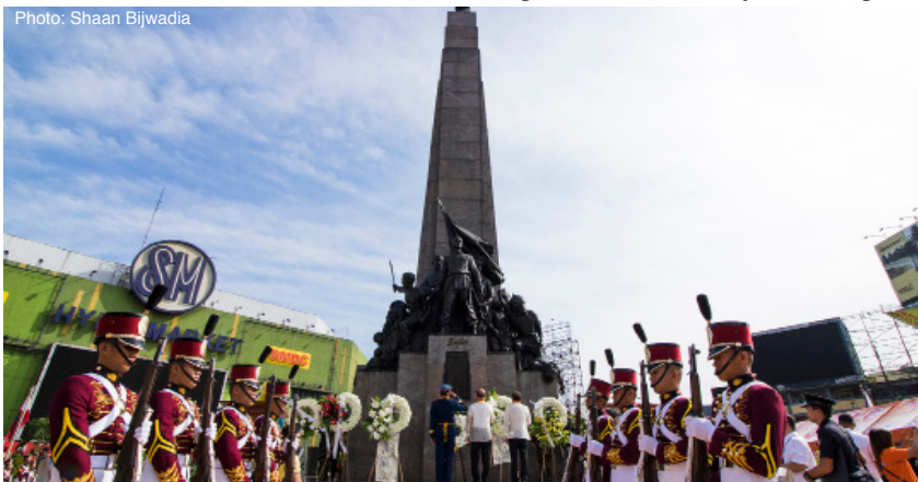
119th Independence Day Celebration in Calocan, Philippines