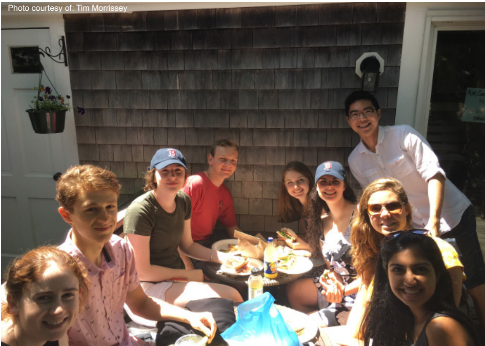
Members of the class of 2020 enjoy time in Cape Cod together