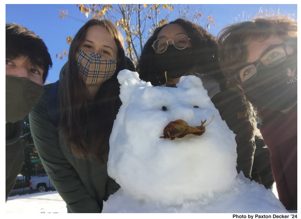
A group of GPSP freshmen adapt to the strict mask-wearing on Boston College's campus

The pandemic has become the ever-present backdrop in my mind; rarely conscious, but always present. It's become mere second nature to mask-up before leaving my room, to stand on the obnoxiously bright strips of tape reminding me where each six feet is, and to unconsciously death-stare people whose masks sit below their nose, or God forbid, past their mouth to carefully