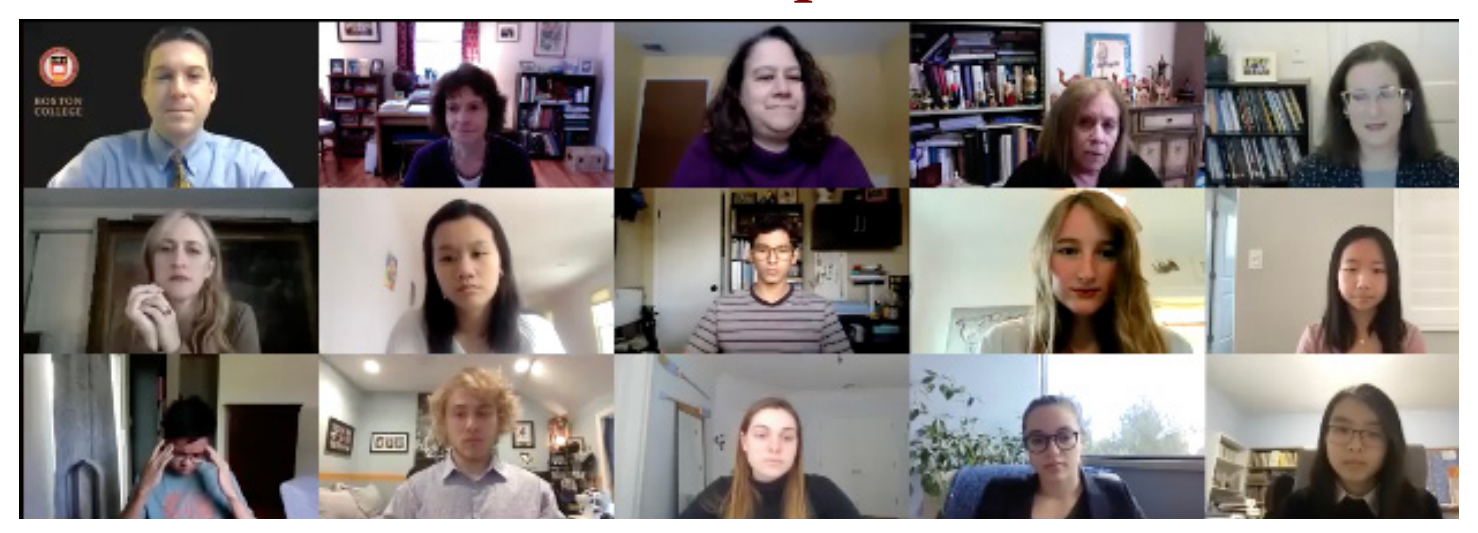
Members of the GPSP program conduct a mock seminar with a group of prospective Presidential Scholars for the Class of 2025.