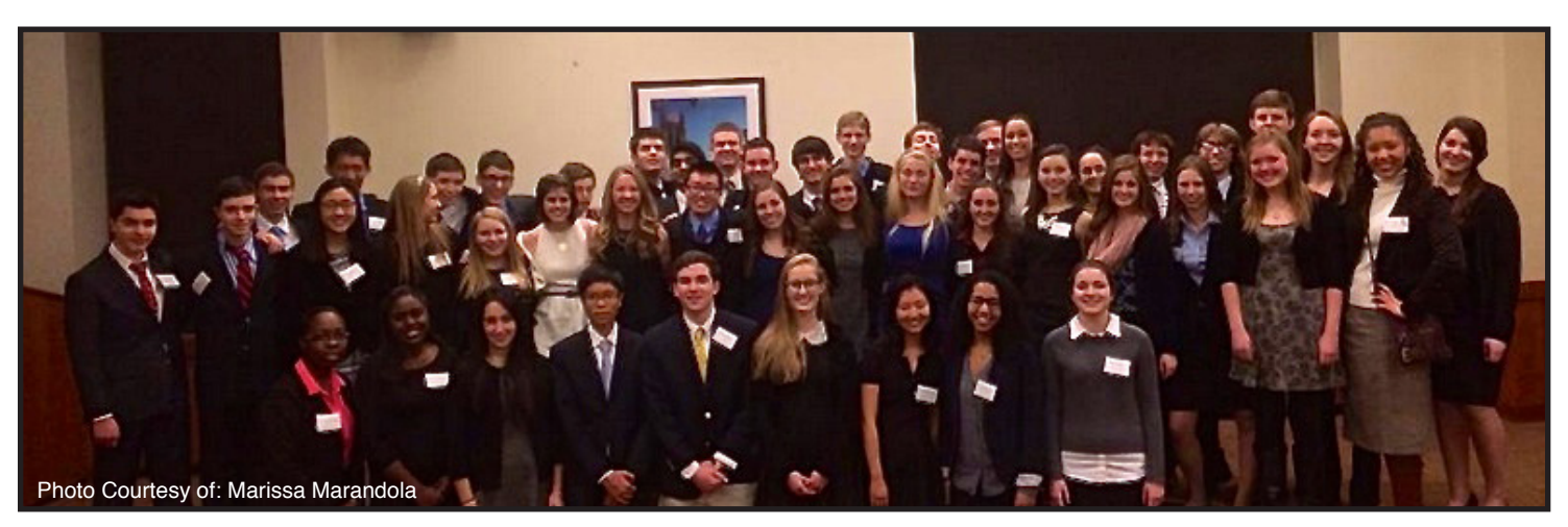
Prospective Scholars gather for a photo after the formal dinner.