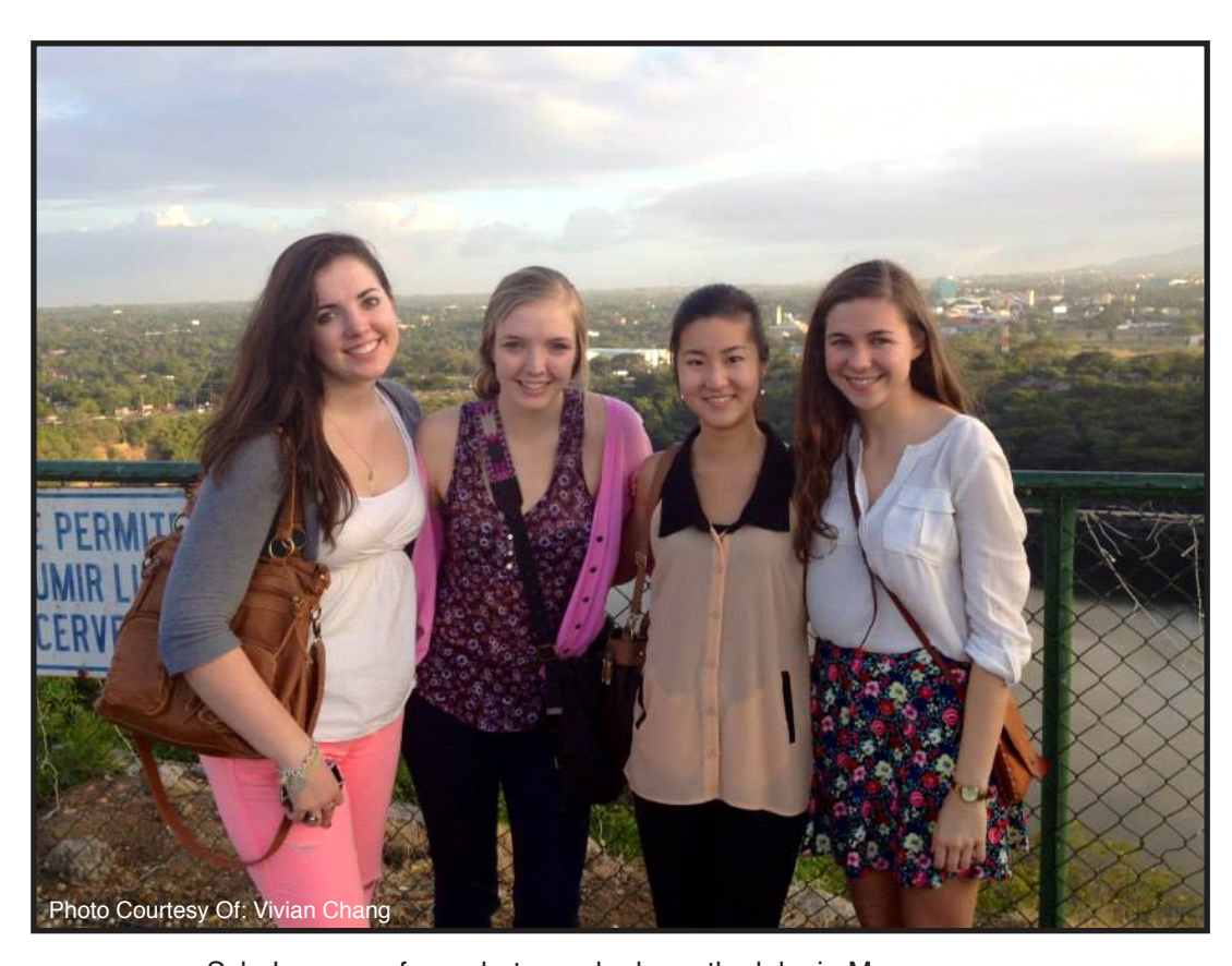
Scholars pose for a photograph above the lake in Managua.

individuals who feel inspired and called. Our trip allowed us to meet several role models for the work each of us plans to do in social justice.