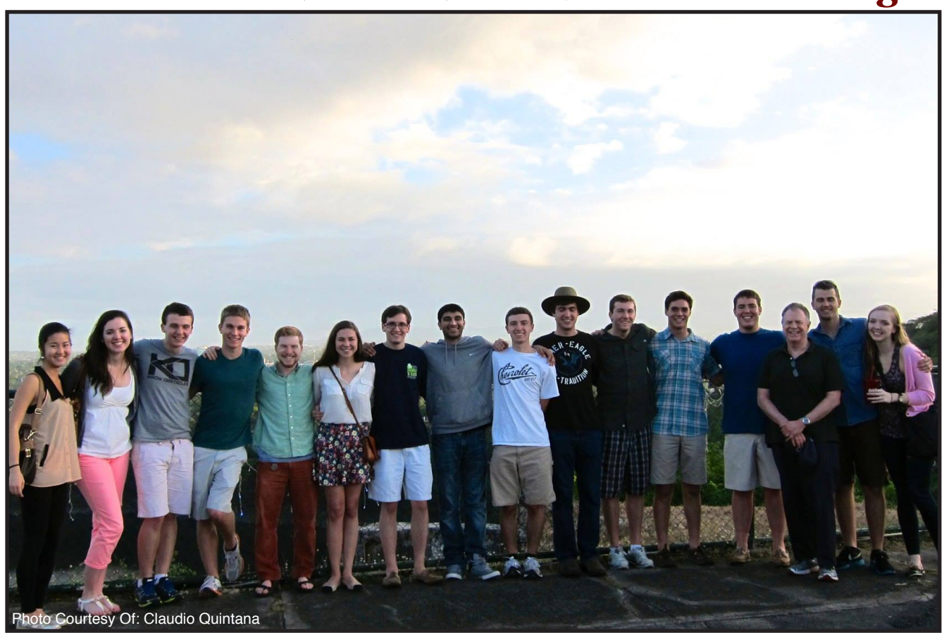
The Scholars had an opportunity to visit the Statue of Sandino.