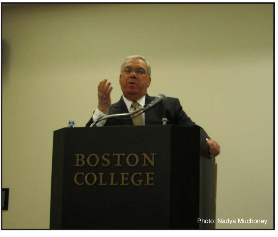
Mayor Menino addresses Boston College Students in regard to the importance of education in the city of Boston.