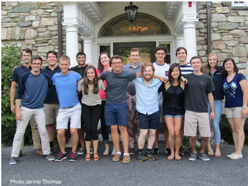
The Class of 2016 pose for a class photo at their final Dover retreat.

While each senior undoubtedly had a unique experience, unmatched by any of his or her predecessors, all of their experiences share a common thread—they served to enlighten each Scholar on his or her prospective role in the professional workforce and acclimate them to life after Boston College. The class of 2016 as a whole was able to refine their leadership skills, attain real-world career experience, and further develop the talents that make them stand out in a professional environment.