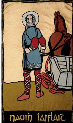
Saint Larflaith (1904) Sodality Banner, designed by Jack Yeats, executed by Dun Emer Industries, for St. Brendan's Cathedral, Loughrea, County Galway.