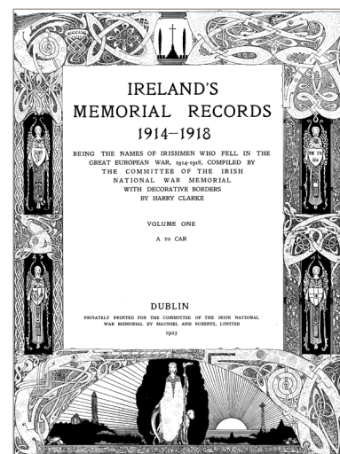
Éire Page , Harry Clarke's illustrations for Ireland's Memorial Records 1914-1918 (1923)