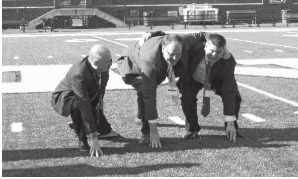
Irish Institute participants at University of Michigan, Ann Arbor's "Big House"

The New Year began with a program that explored issues surrounding educational policy in primary and secondary education. Through meetings with U.S. colleagues in Boston, and in Indiana at Indianapolis and Bloomington, the group studied student assessment, technology in the classroom, teacher training, the rise of charter schools, and bridge programs that seek to alleviate shortcomings in students' college preparation. A highlight of the trip was our visit to the Minuteman Career and Technical High School in Lexington, Massachusetts where participants dined in the student-run restaurant—the Fife and Drum—then toured campus with student leaders.