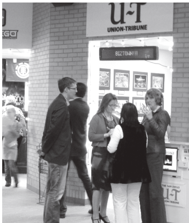
Irish Institute participants in San Diego at Junior Achievement's Biztown, a student-run small business marketplace model.