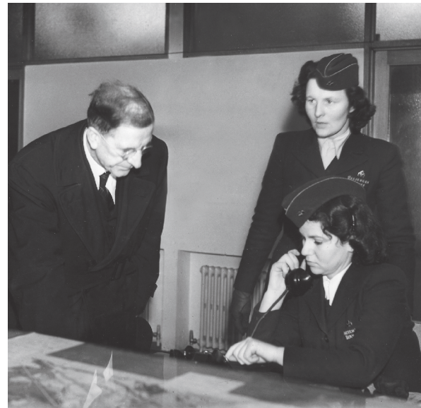
Eamon de Valera with Aer Lingus ground staff, Dublin Airport, 1947.