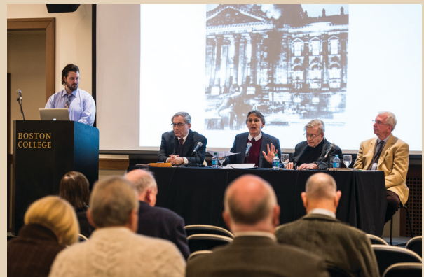
A discussion panel takes place during the “Legally Blind” conference held in March.