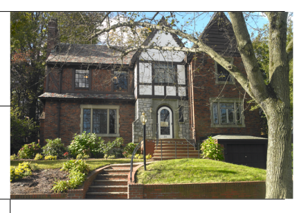
NO. 58: SEPTEMBER 21, 2011