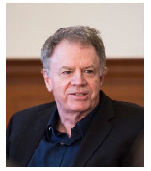
don't think that many organizations do a lot of self-examinations.

It strikes me that there needs to be a greater self-examination that happens. I