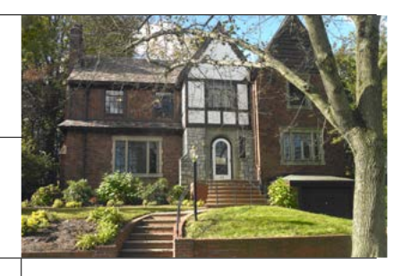
NO. 53: MARCH 23, 2011