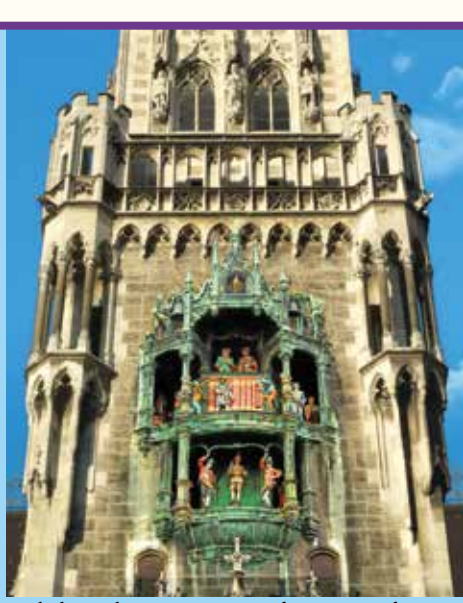
Delight in the reenactments of two scenes from Munich's history in the Glockenspiel on the city's town square, Marienplatz.

After breakfast, continue on the Berlin and Potsdam Post-Program Option or transfer to the airport for your return flight to the U.S.