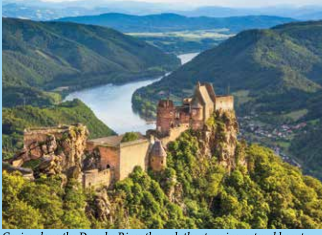
Cruise along the Danube River through the stunning natural beauty of the Wachau Valley landscape, a UNESCO World Heritage site.