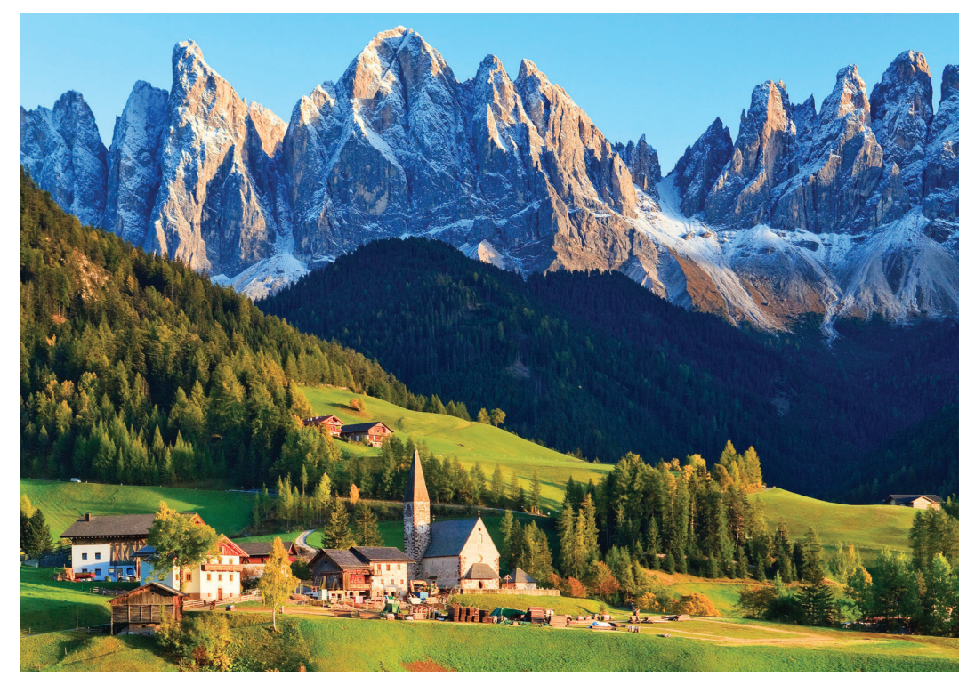
We enjoy stunning Dolomites scenery in the South Tyrol.