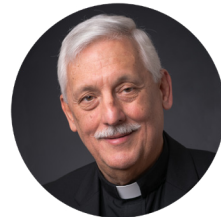
Arturo Sosa, S.J.

The Symposium will join the International Association of Jesuit Universities (IAJU) and the International Federation of Catholic Universities (IFCU) for a concluding Mass celebrated by Father General Arturo Sosa and Cardinal Seán O'Malley.