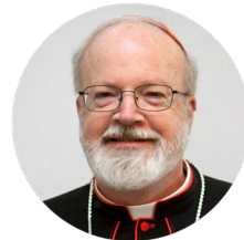
Cardinal Seán O'Malley, OFM Cap.

SUPERIOR GENERAL OF THE SOCIETY OF JESUS