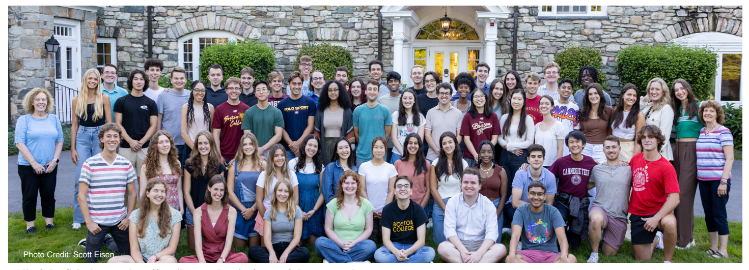
All of the Scholars and staff smile together in front of the retreat house