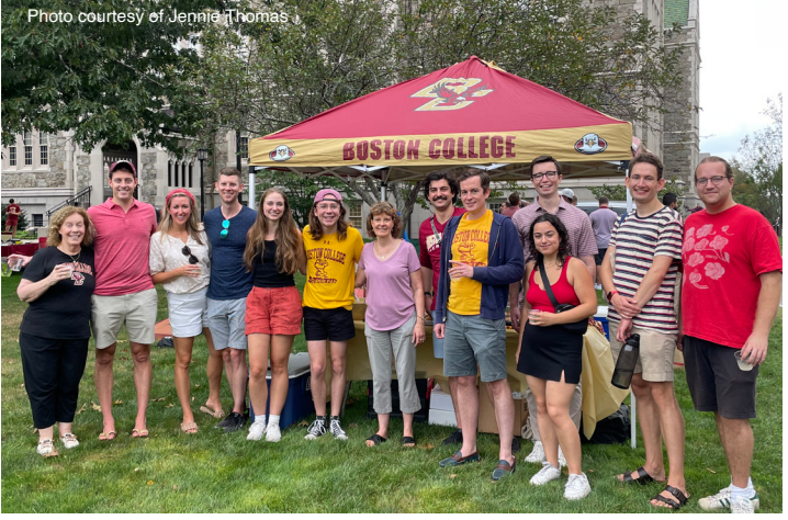
Football tailgate featuring GPSP alumni, current Scholars, and staff