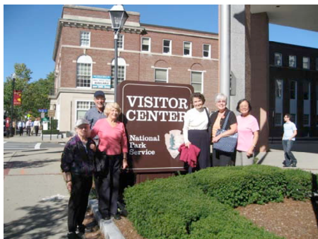
The ARF Book Club on a field trip to the Adams National Historical Park in Quincy related to reading of the book John Adams.