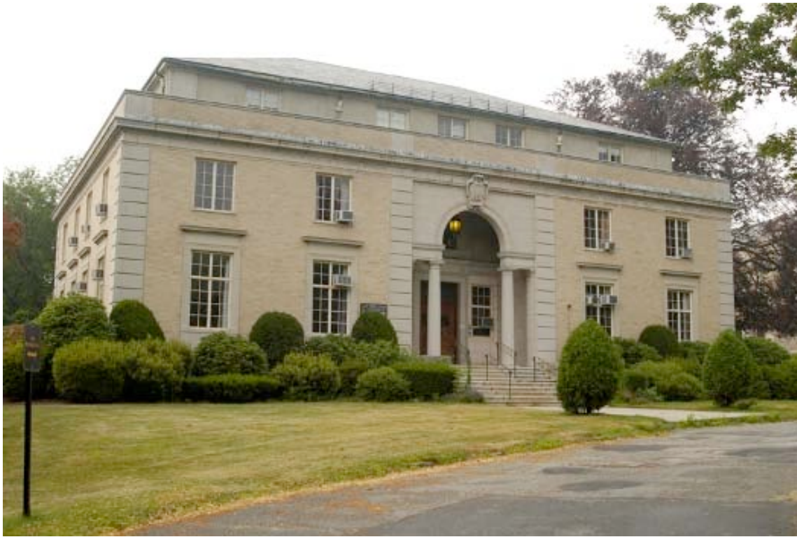
3 Lake Street, Boston College Brighton Campus.