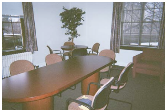
ARF Conference Room at 3 Lake Street

There also is a small bathroom between the two rooms. Retired faculty interested in having a key to the rooms and the building should contact Norm Berkowitz. (berkowin@bc.edu).