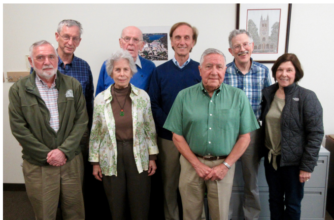
2018-2019 Executive Committee

The BCARF Newsletter is published annually and is available (along with past issues) on the BCARF website. Notification of its publication will be sent to the listserv.