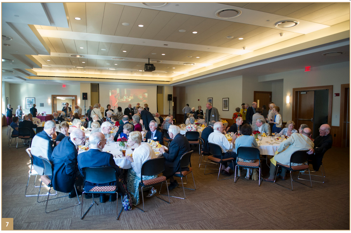
BCARF Newsletter, Summer 2014