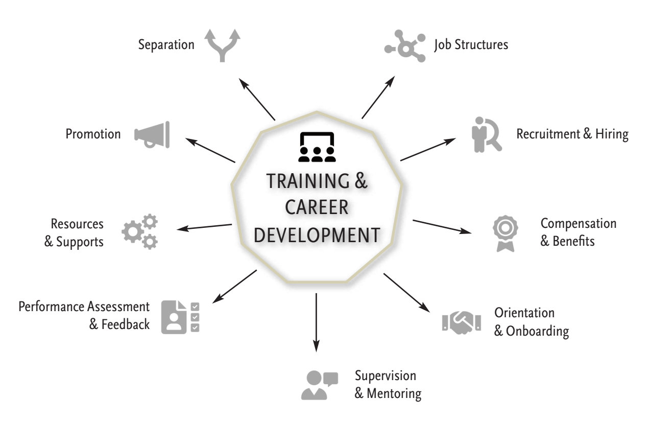
Figure 15: Connecting Innovation in Training and Career Development to New Opportunities for Change in Other Employment Systems

As suggested by Figure 15, innovations introduced to your organization's Training and Career Development System might affect some of the other employment systems. For example, your organization might change some of its benefits options if employees are allowed to work remotely (for example, resources for a home office, etc.).