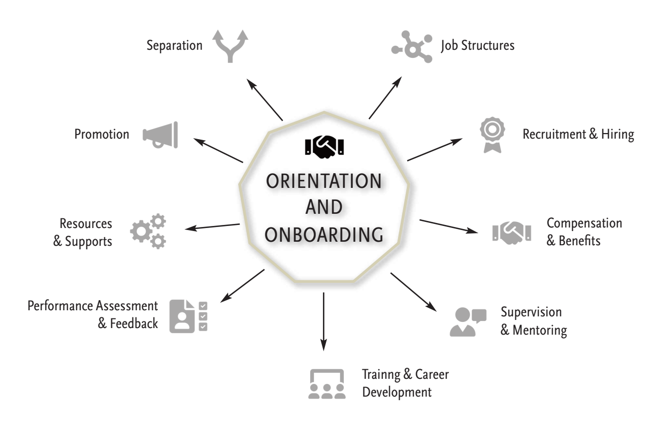
Figure 15: Connecting Innovation in Orientation and Onboarding to New Opportunities for Change in Other Employment Systems

As suggested by Figure 15, innovations introduced to your organization's Orientation and Onboarding System might affect some of the other employment systems. For example, your organization might change some of its benefits options if employees are allowed to work remotely (for example, resources for a home office, etc.).