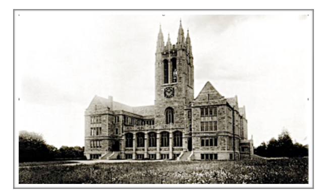
1913: Construction of Recitation (Gasson) Hall and the Fulton Debate Room