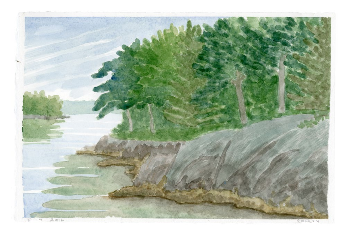
Cove East: Waters Edge, 7/2016.14, watercolor, 7½ x 11"