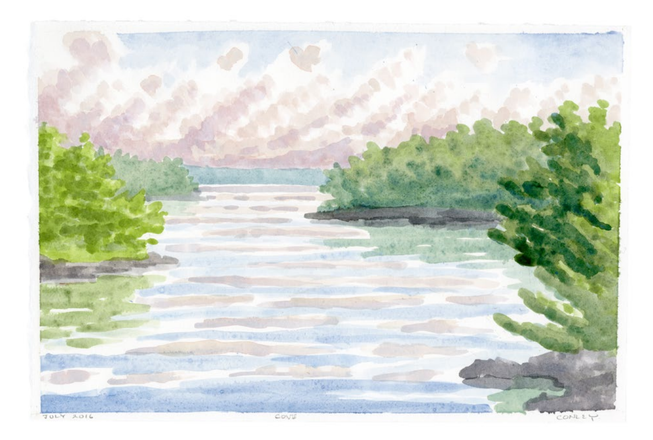
Cove North: Pink Clouds, 7/2016.6, watercolor, 7½ x 11"