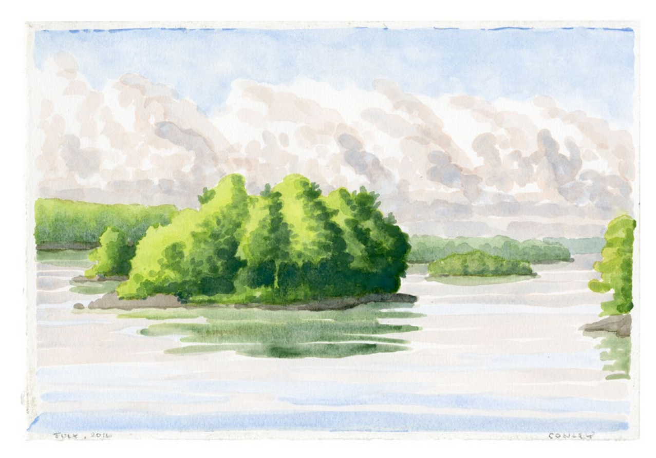
Cove North: Afternoon Light, 7/2016.13, watercolor, 7½ x 11"