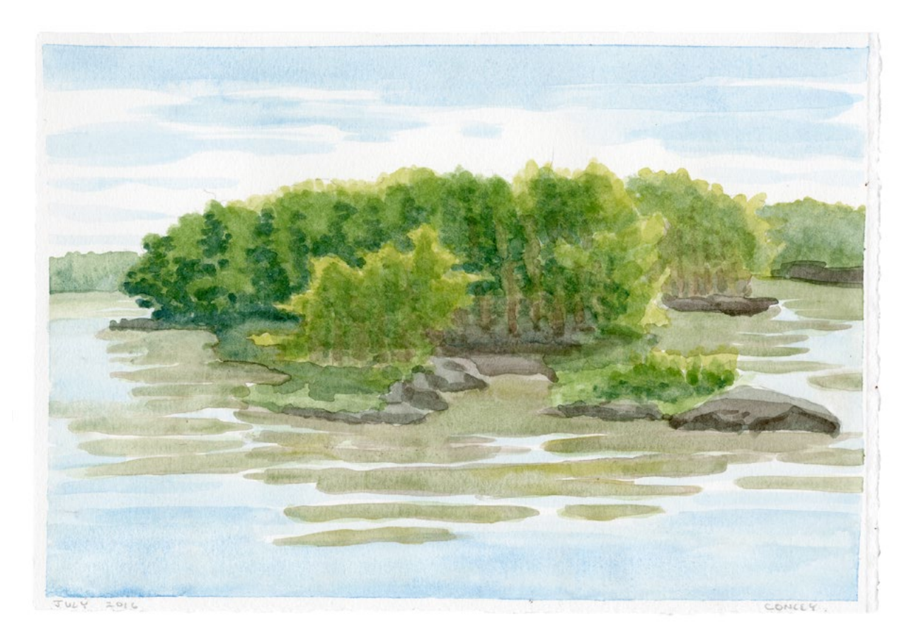
Cove South: Spar Island, 7/2016.8, watercolor, 7½ x 11"