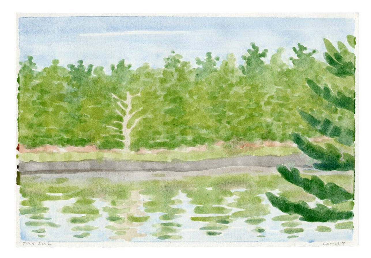
Cove West: Dead Pine, 7/2016.3, watercolor, 7<sup>1</sup>/<sub>2</sub> x 11"