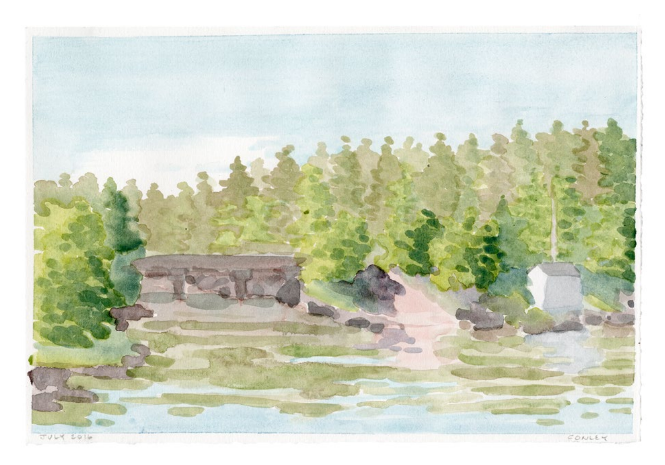
Cove South: Boat Launch, 7/2016.15, watercolor, 7<sup>1</sup>/<sub>2</sub> x 11"