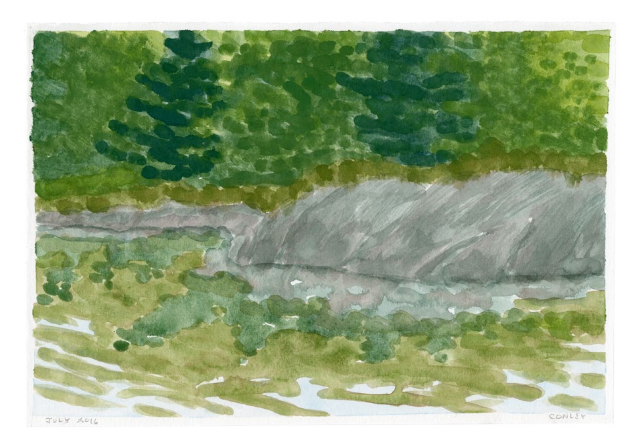
Cove East, Ledge, 7/2016.12, watercolor, 7½ x 11"