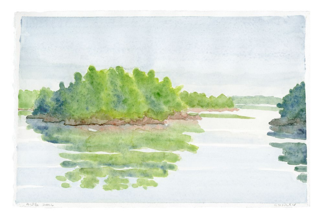
Cove North: Calm Morning, 8/2016.5, watercolor, 7½ x 11"