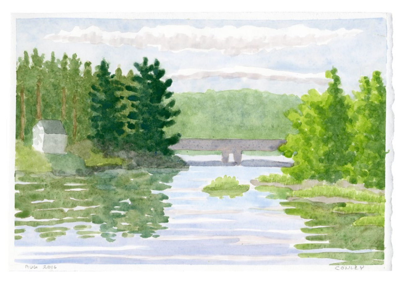
Cove South: Bridge, 8/2016.10 watercolor, 7½ x 11"