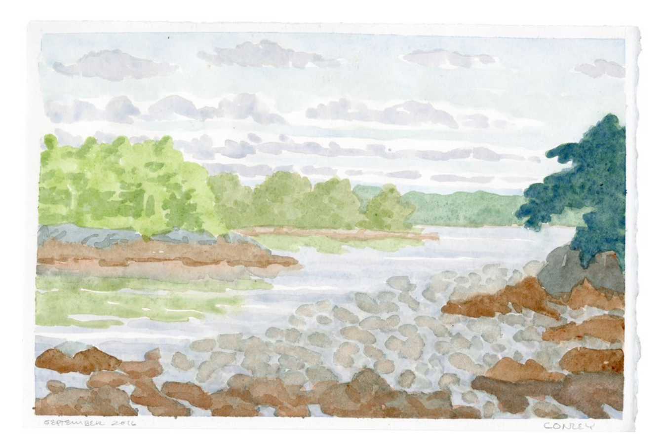
Cove North: Low Tide, 9/2016.1, watercolor, 7½ x 11"