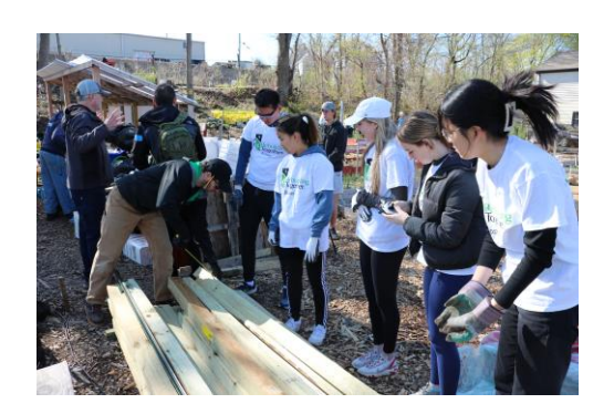
Jenks Class of 2023 doing community service with Rebuilding Together Boston