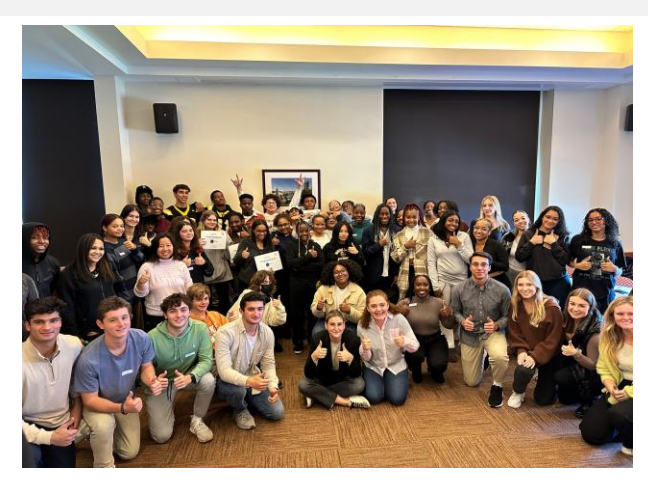
Students from Boston Latin School after the pitch competition

Eleven internship grants were awarded to students who participated in unpaid summer internships at various civic organizations whose focus areas included combatting hunger, public affairs, immigration and refugee services, environmental conservation, criminal justice, and museum education. Five travel grants were also awarded to students who participated in opportunities that supported their career interests, including public health, public service consulting, psychology, and human trafficking.