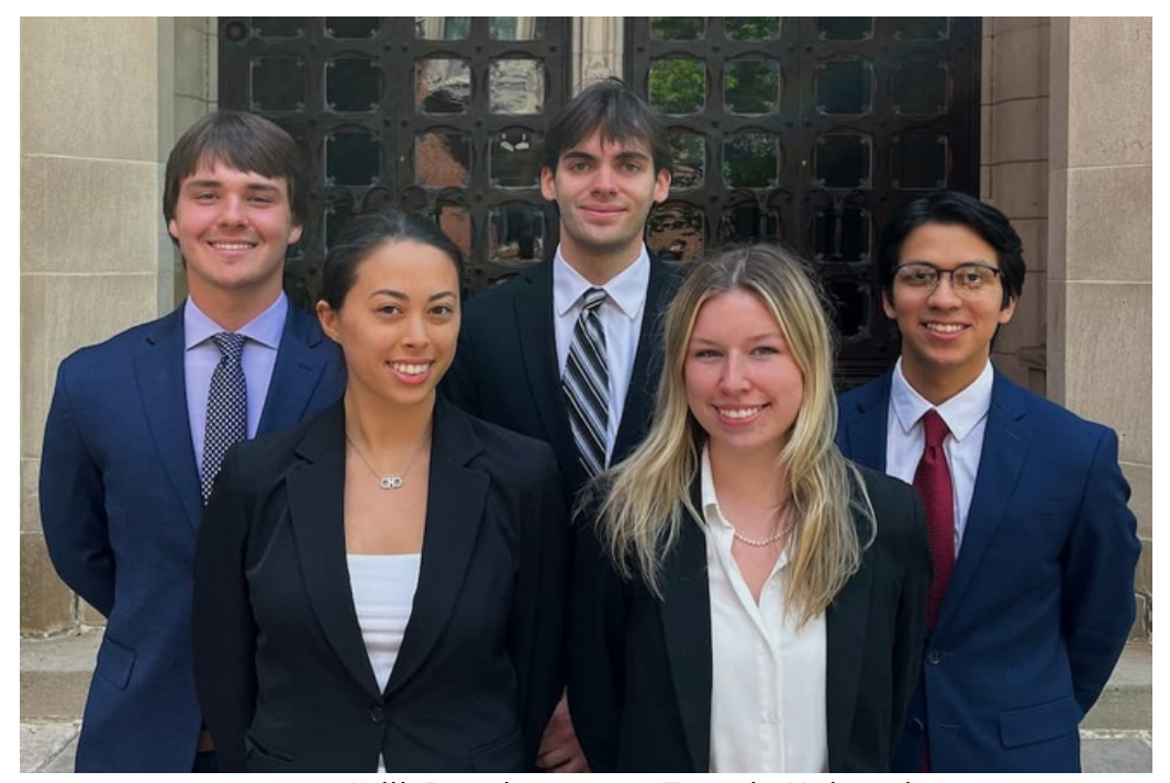
Wilk Development - Temple University

BOSTON COLLEGE CARROLL SCHOOL OF MANAGEMENT