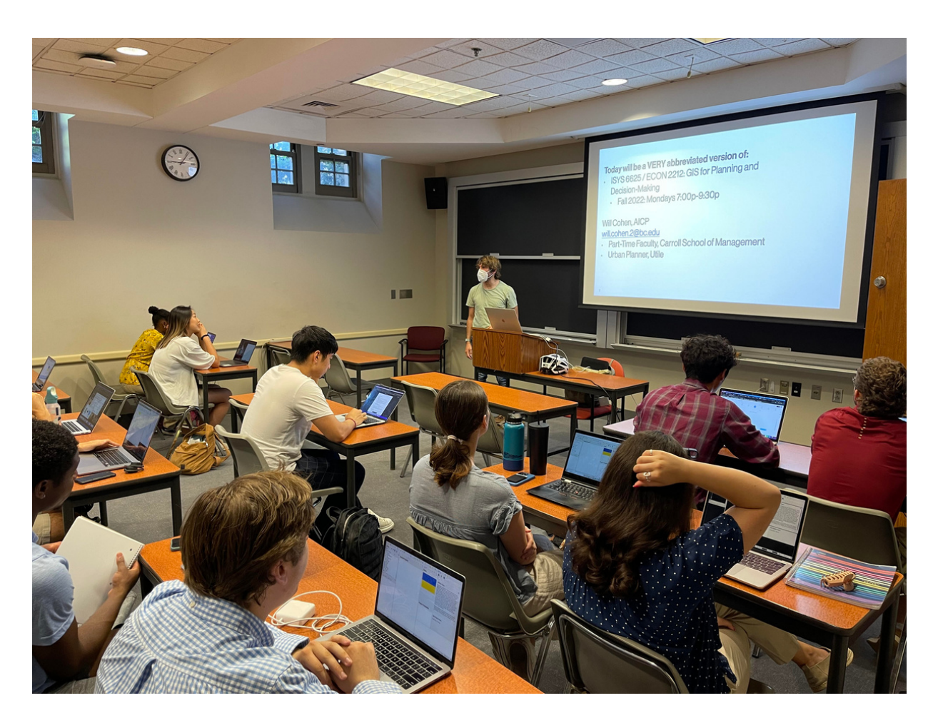
GIS classroom session

Summer 2023 Corcoran Center interns will be the largest group of interns the center has had to date. The center is placing 26 interns at 22 placements across the City of Boston.