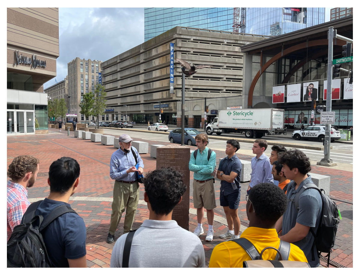
Corcoran Center 2022 interns touring Back Bay

BOSTON COLLEGE CARROLL SCHOOL OF MANAGEMENT