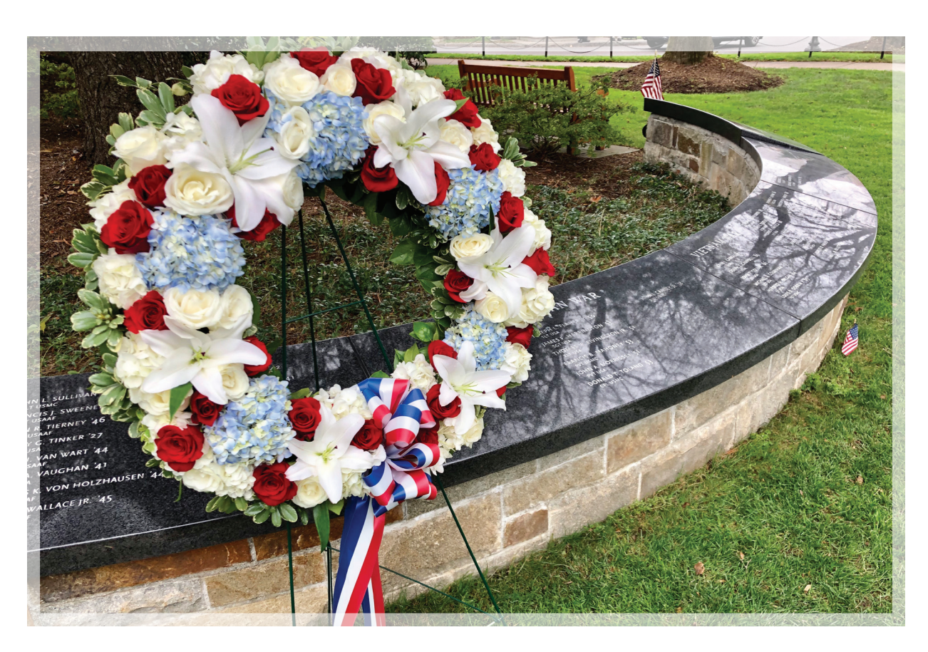
THURSDAY, NOVEMBER 11, 2021 9:30 A.M., St. Mary's Chapel