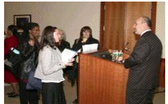
Conference Attendee Speaks to Panel Presenter at the October 2007 Diversity Challenge Conference