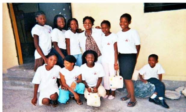
Boston College Students with Haitian Students

Native American Images Study. The use of Native American (or American Indian) images and symbols in American culture is often blatantly racist and offensive. One example of this is the use of Native American imagery by professional sports teams. A qualitative pilot study was designed to investigate individual and group reactions to a selected variety of images. The varying reactions to the images were analyzed to highlight the differences between the research teams. The preliminary findings were presented at the 2007 American Psychological Association conference. Currently, the team is working on writing a manuscript to publish the findings.