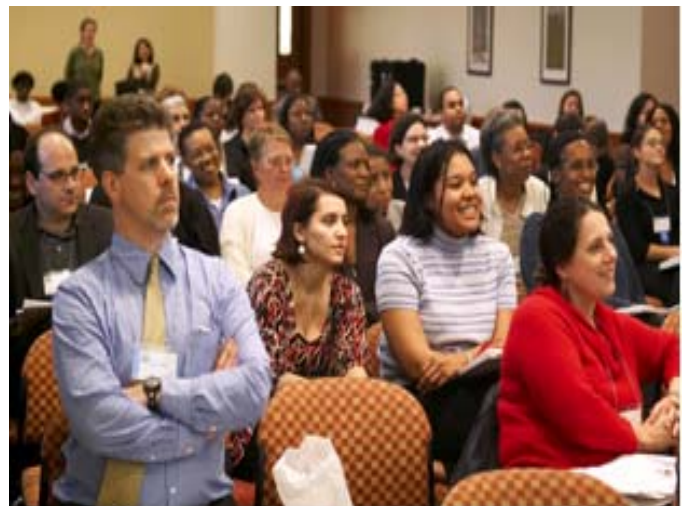
Participants from the 2007 Diversity Challenge Conference listen to keynote speaker

Understanding the racial and cultural factors that are associated with choices, usage, and effectiveness of contraceptives among Black and Latina young women is an essential first step to developing interventions aimed at reducing sexual activities, lowering the rate of unintended pregnancies, and occurrence of sexually transmitted diseases among these two cultural groups.