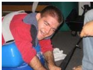
Patch: always a laugh and a smile.