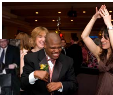
Freddie dancing with the stars