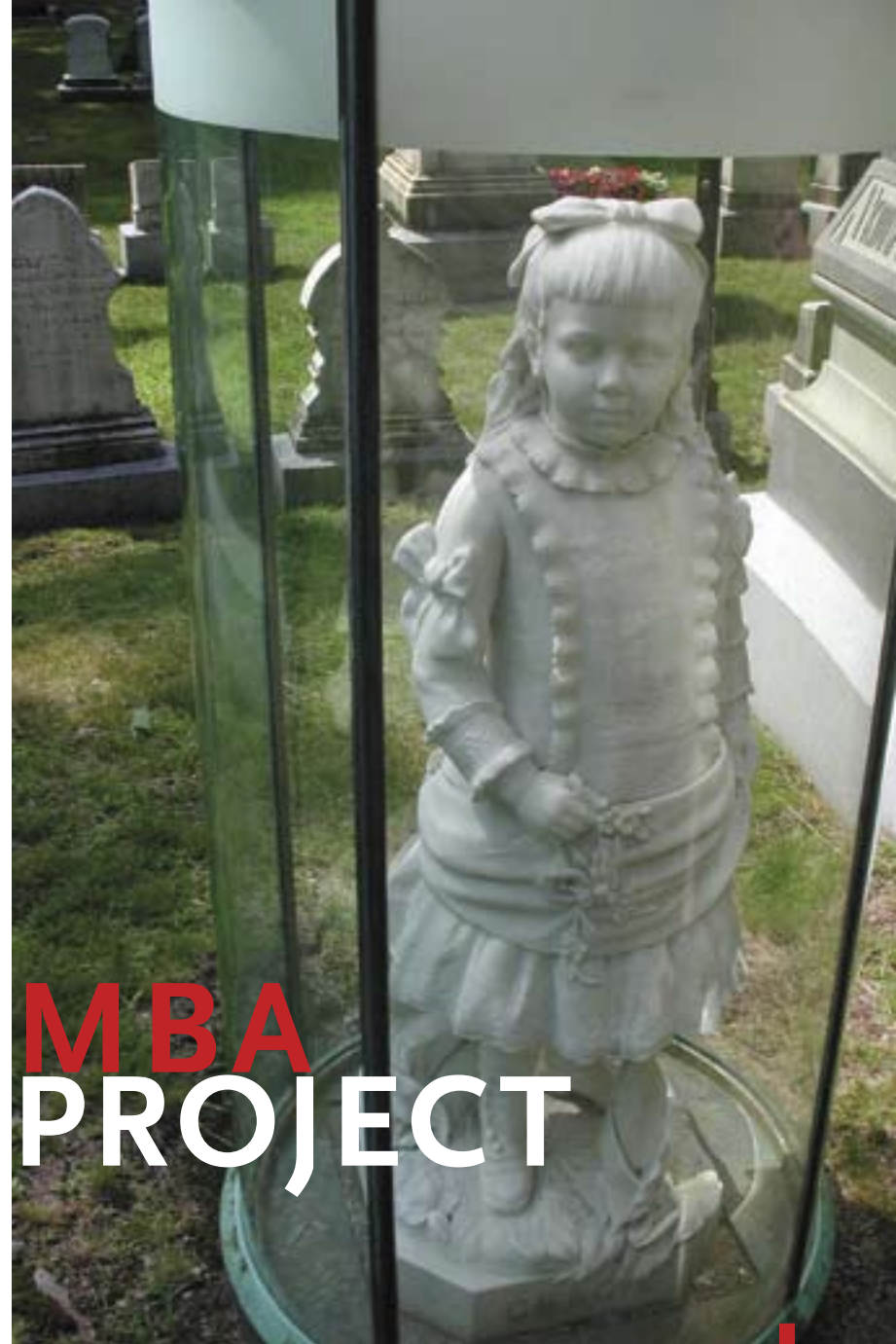
The BC MBA Consulting Project team identified Forest Hill Cemetery's position within the art museum and park markets. Sydney H. Morse's "The Girl in The Glass" (shown above) is one of the marble sculptures featured in the Forest Hill Cemetery.