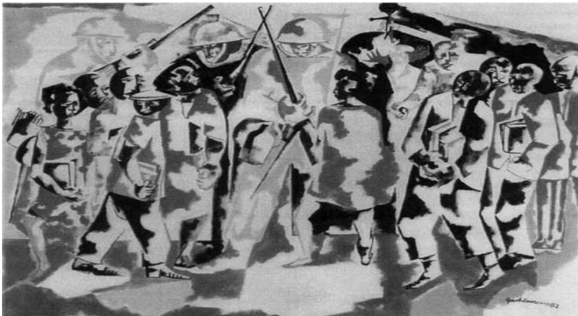
"Soldiers and Students" (1962), Jacob Lawrence