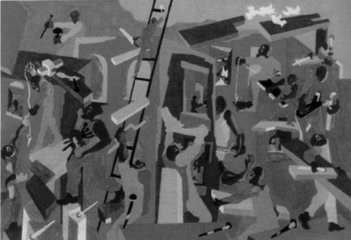
"Builders in the City" (1993), Jacob Lawrence