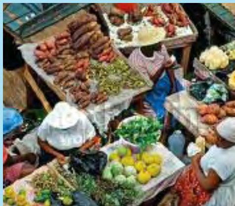
The lively markets of the Caribbean islands offer local treats, including fruits, spices and rum.

A collection of pre-Columbian artifacts from the original inhabitants, the Arawak Indians, can be found in St. John's Museum of Antigua and Barbuda. Optional tours include: historic Antigua; art studios of the island; aerial canopy excursion; helicopter flight over paradise; and off-the-beaten-track island exploration by SUV.