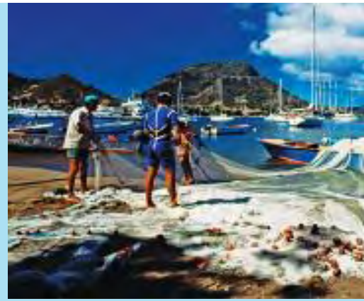
Island fishermen ready their nets for catching some of the fresh fish in the Caribbean.

Cruise into the sheltered natural harbor of Guadeloupe, a région of France, to Pointe-a-Pitre, the island's largest city and economic hub, featuring the liveliest market in the Caribbean. The colorful jamboree of goods to be found on the pier of Quai de la Darse includes local handicrafts and treats such as fine Creole jewelry and colorful dolls, bamboo hats and woven baskets, fruits, rum and spices, as well as French imports. The unique culture of this island is highlighted by the Musée St. Jean Perse, devoted to the island's own Nobel laureate poet, and the Musée Schoelcher, a showcase of items belonging to the abolitionist Victor Schoelcher. Just a few blocks north of the quay, the steel Cathedrale de St. Pierre et St. Paul, designed by Gustav Eiffel is only one of the many French imports on the island. One need travel just outside the city to explore the lush tropical flora and exotic fauna of the island. Optional shore excursions are available, including a treetop canopy walk through the tropical