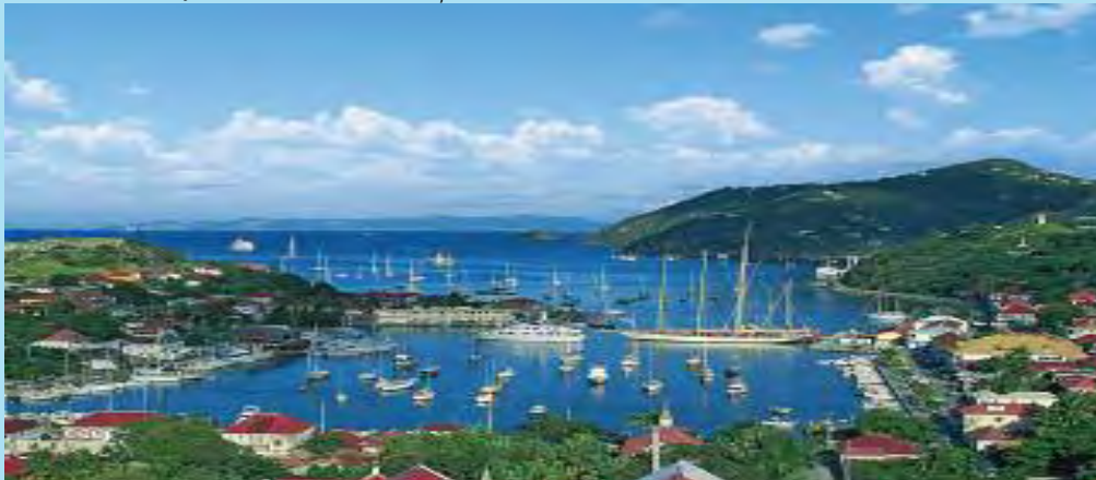
Sailboats speckle the cerulean waters surrounding Gustavia, St. Barts, a posh holiday destination notable for its distinct Breton, Norman and Swedish influences.

The French West Indies island of St. Barts was once a destination exclusive to the rich and famous, chic and stylish, yet casual. The island is known for its secluded coves, pristine beaches and hillsides dotted with