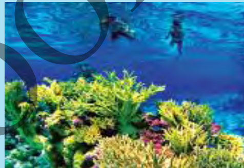
The Lesser Antilles' pristine coasts and secluded coves make ideal snorkeling sites.

capital city, St. John's, is English Harbour, a meticulously restored 18th-century naval dockyard that was the home port of Admiral Lord Nelson and his British fleet. Just above the dockyard, Nelson's lookout point on Shirley Heights offers spectacular views of the neighboring islands, Montserrat and Guadeloupe. There are over 80 archaeological sites on Antigua, the oldest dating back over 4,000 years.