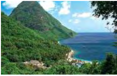
The Petit and Gros Pitons of St. Lucia are the island's most recognizable features, and are part of a UNESCO World Heritage site.