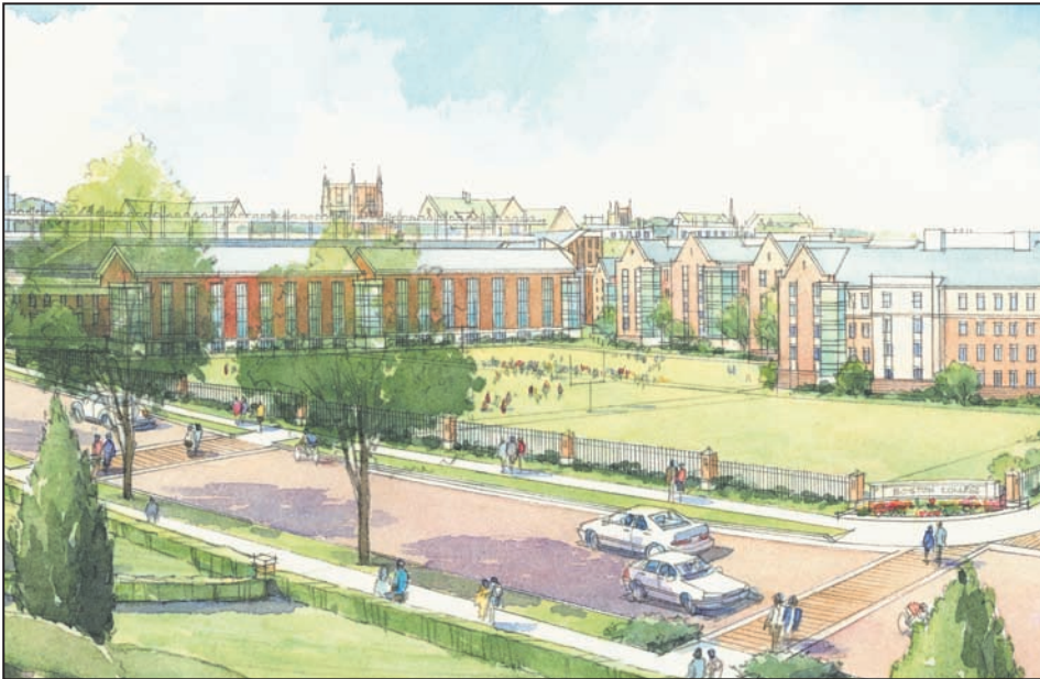
Undergraduate housing proposed for Shea Field

on Shea Field, 420 beds on the current More Hall site and 175 beds on Lower Campus, will enable the replacement of outdated Edmonds Hall and several modular housing units. • Develop the Brighton Athletics Center , which will include a 1,500-seat baseball and 500-seat softball field, as well as a multi-purpose field for intramural sports, and a field