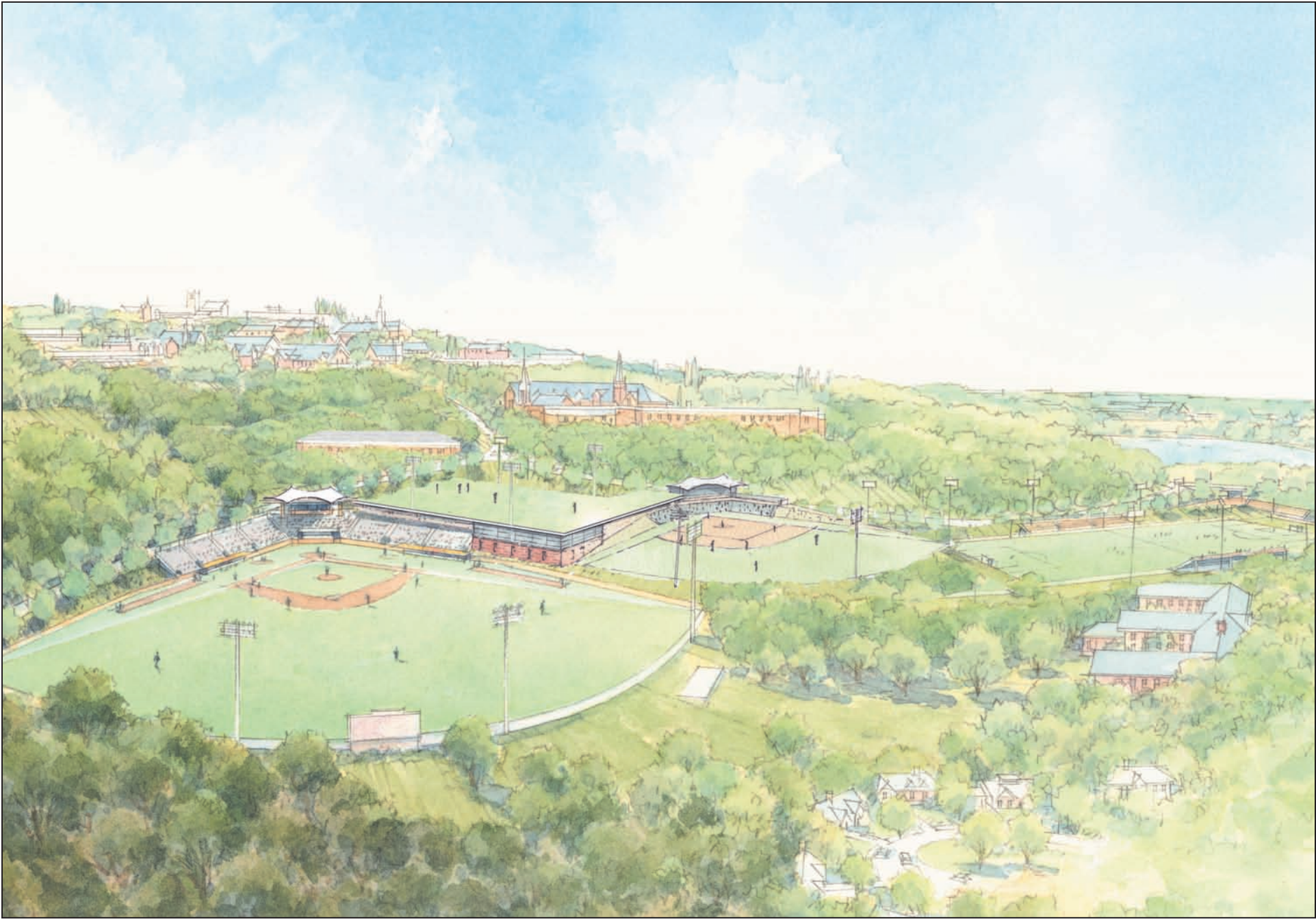
Playing fields, Brighton Campus