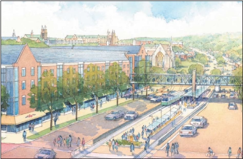
New residence hall on St. Thomas More Drive and Commonwealth Avenue