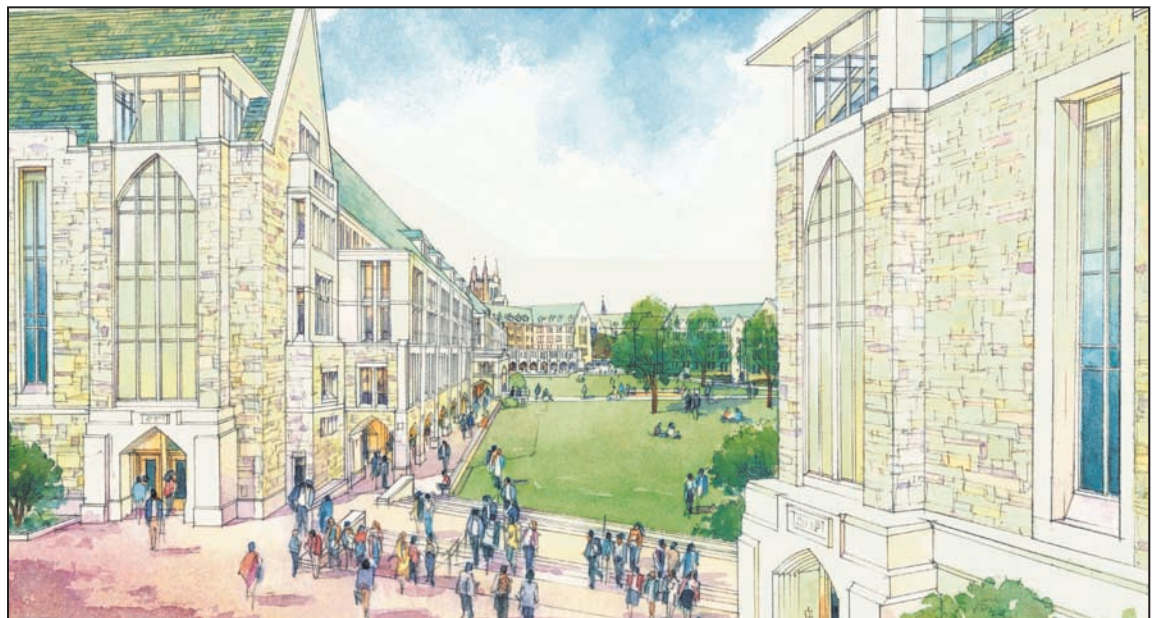
Two new academic buildings grace a new gateway to Middle Campus

• Construct four new academic buildings on the Middle Campus in Chestnut Hill, including: Stokes Commons, an 85,000 square-foot academic facility to be used as an interim student center and dining hall, a 125,000 square-foot academic facility for the humanities, a 75,000 square-foot facility to house the Graduate