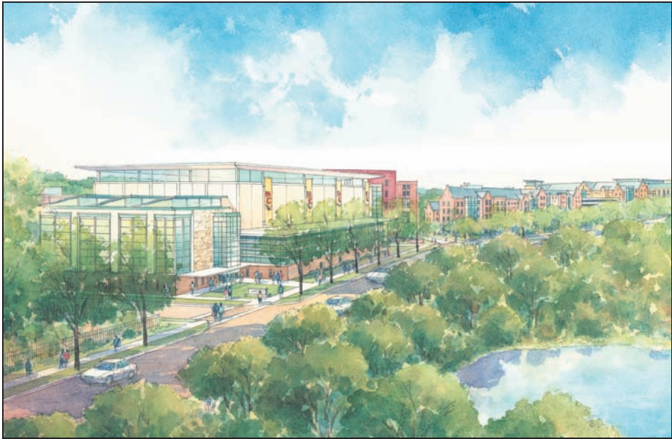
Recreation Complex, St. Thomas More Drive