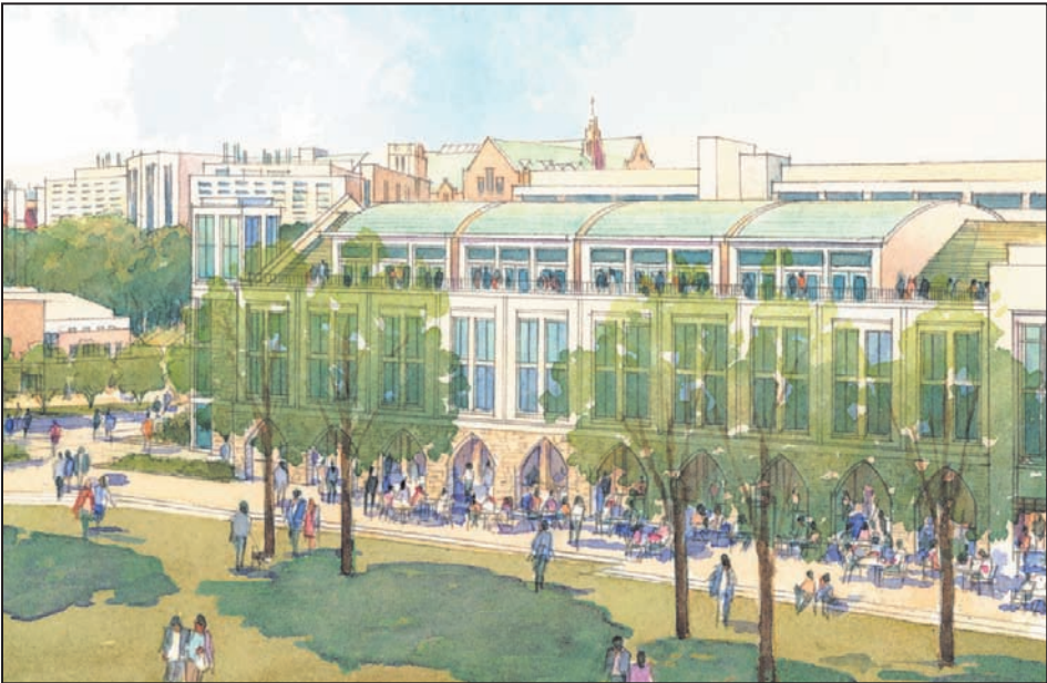
University Center viewed from Walsh Hall, Lower Campus