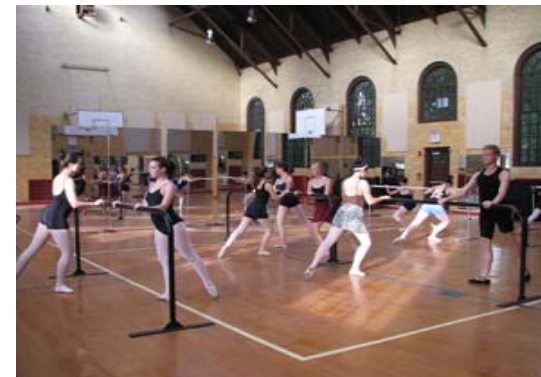
Brighton Dance Studio

"Howdy partners! I'm the Brighton Dance Studio. I used to be a gym. No seriously, look at the basketball hoops. Now I'm a dance studio. I've come a long way haven't I? I think so. I'll host some of your dance classes and rehearsals. I can get pretty cold, so bring warm layers!"