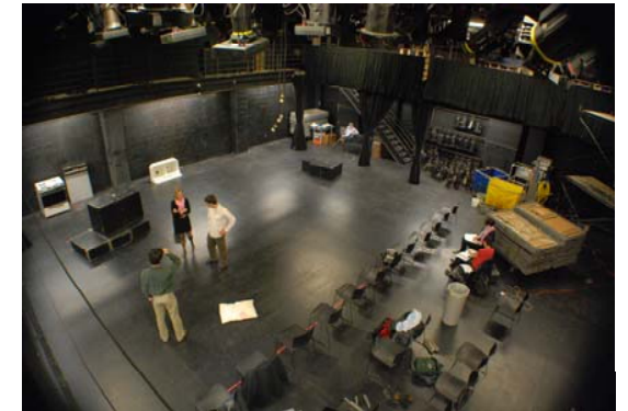
Bonn Studio Theater

"Hey there! I'm the Bonn Studio Theater in the Robsham. I'm a black box theater; very different from Mainstage. I house at least seven productions, countless classes, and workshops. We'll most likely be spending a good deal of time together, and I couldn't be more excited!"