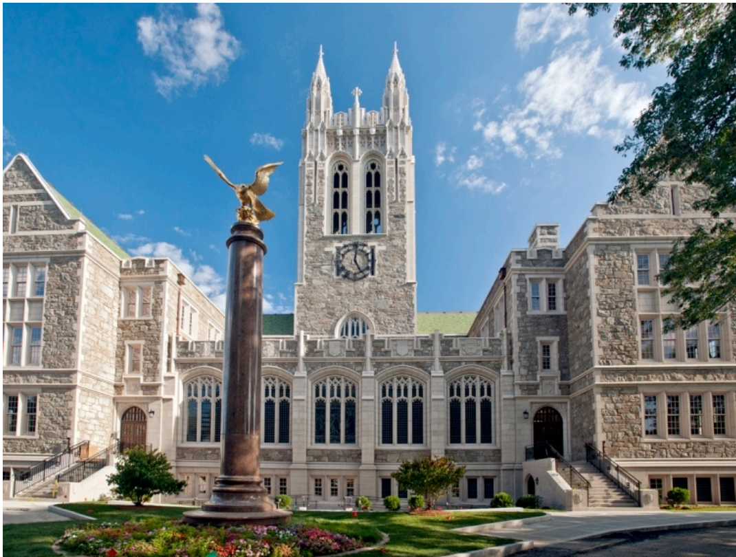
Fulton Debate Reunion 2012