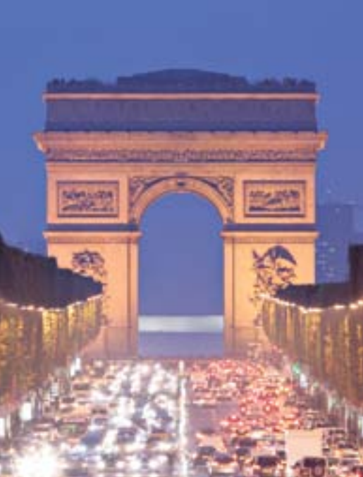
L'Arc de Triomphe