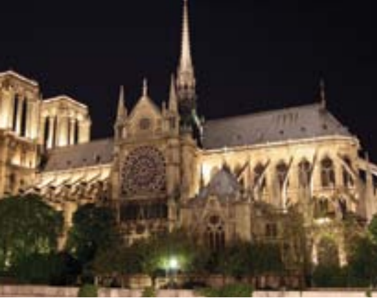
Notre Dame Cathedral