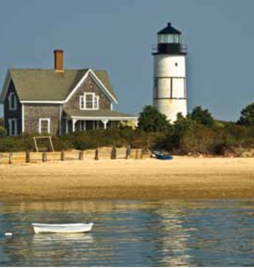
Cape Cod, Massachusetts