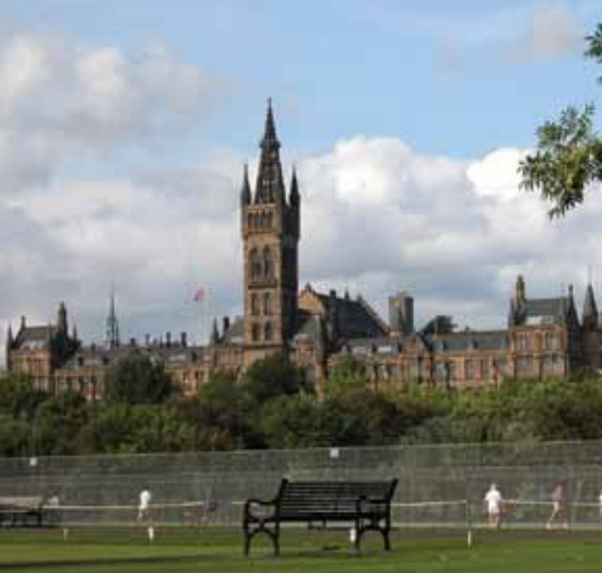
University of Glasgow