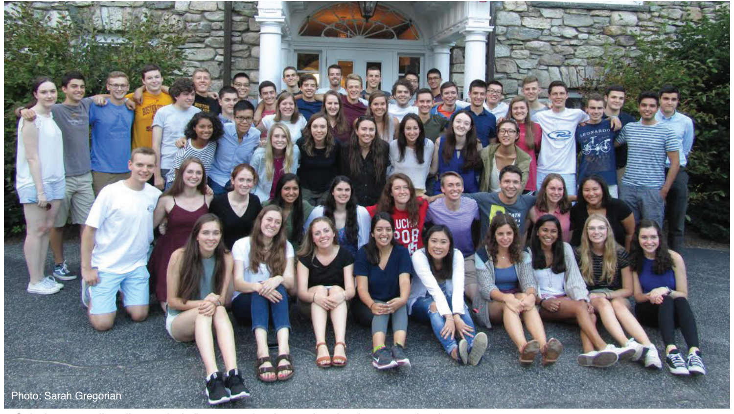
Scholars are all smiles at their first event back together for the new school year