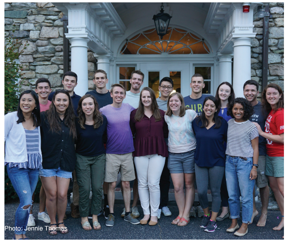
Class of 2017 poses together at their final Dover Retreat

by working abroad in a completely foreign place, you can do anything for 10 weeks. What better time for it than junior summer?