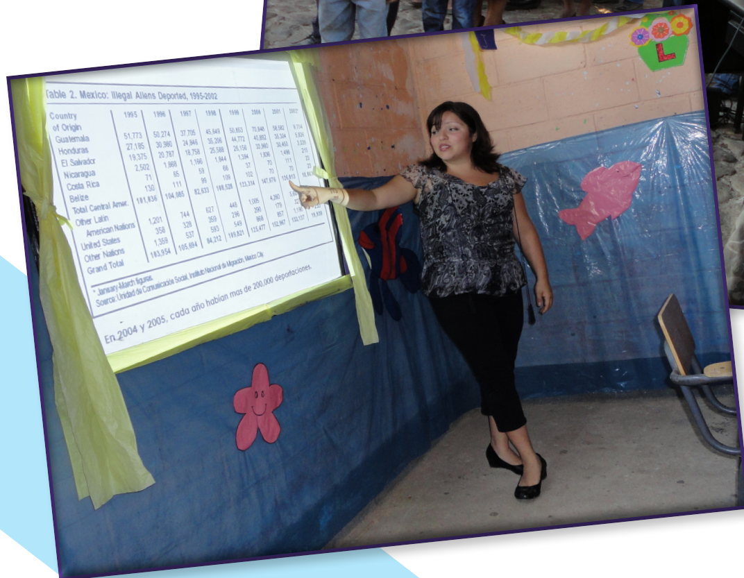
Tabla 2. Mexico: Illegal Aliens Deported, 1995-2002