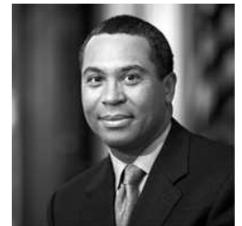
Democrat Deval Patrick will be the new Governor of MA

discourage the BC Republicans. Instead, this should serve as motivation for our future. As young adults, have the energy that political campaigns demand, and we should continue to make and exceed our own expectations. In two years, we must influence others with our high expectations, and our cumulative efforts will produce successful Republican candidates in 2008. May we continue to have these high expectations, and may they continue to be perpetuated by our energy as BC Republicans.