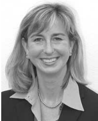
Lt. Governor Kerry Healey lost the Gubernatorial election last Tuesday